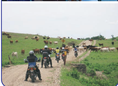
above images, 2006 Stampede